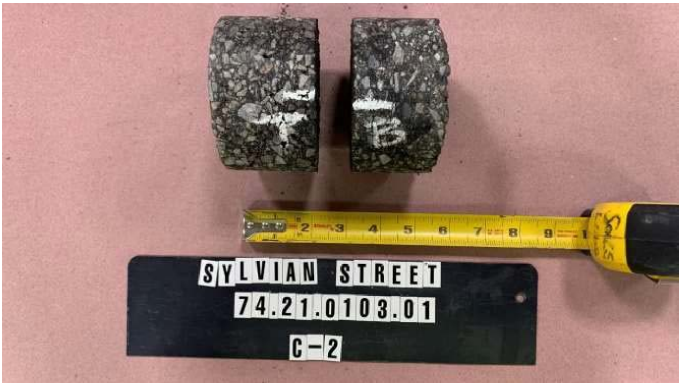
Fig. 2 Sample C-2