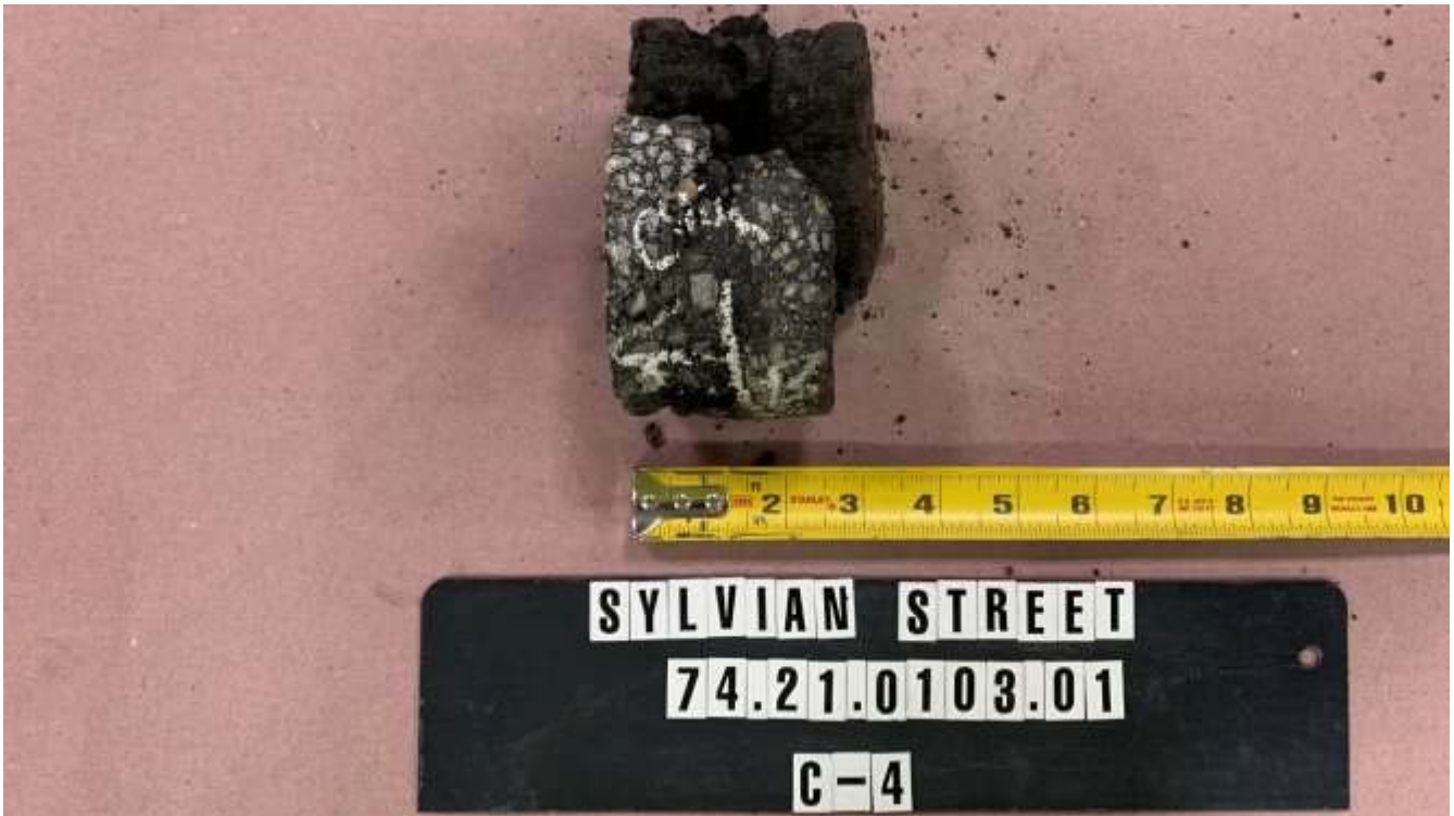
Fig. 4 Sample C-4