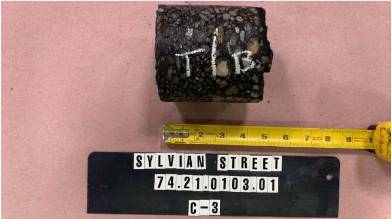
Fig. 3 Sample C-3