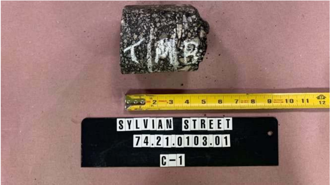
Fig. 1 Sample C-1