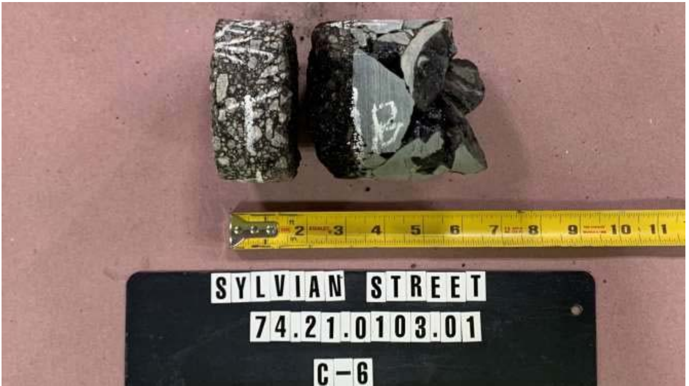
Fig. 6 Sample C-6