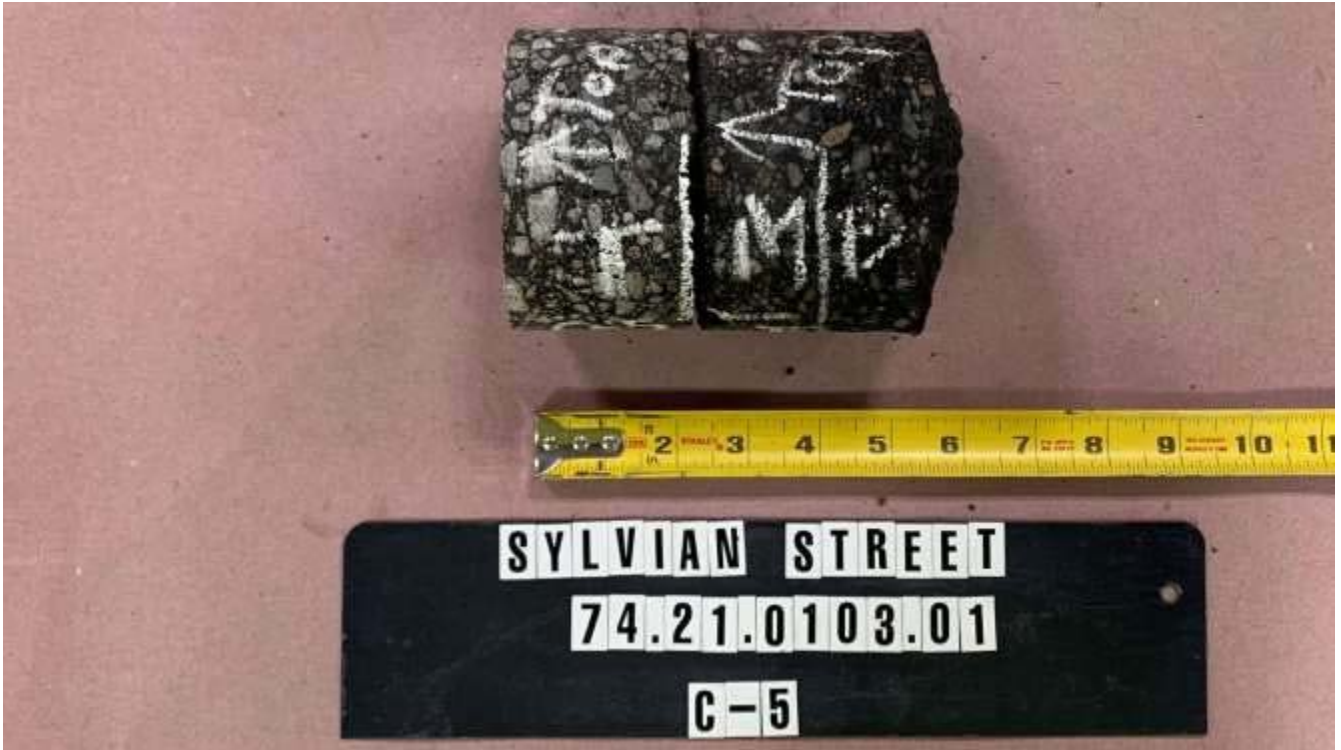
Fig. 5 Sample C-5